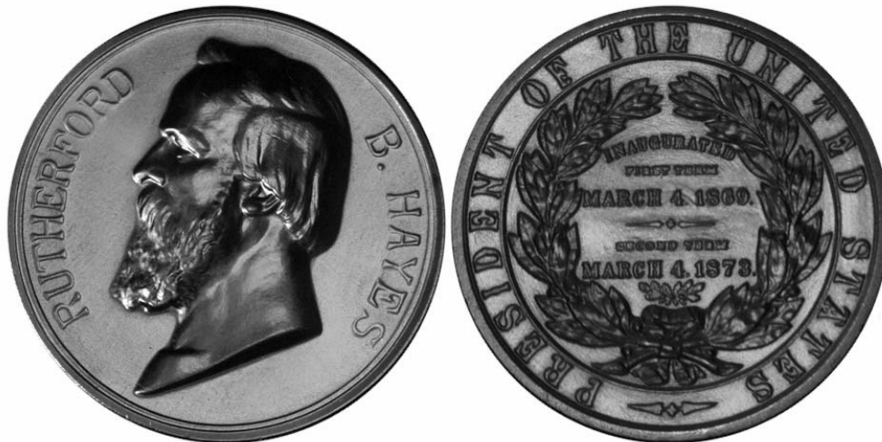
Figure 1. This muled Presidential US mint medal shows Rutherford B. Hayes whose obverse die was mistakenly paired with the reverse die that is normally restricted for use with the Ulysses S. Grant Presidential medal die.

As of May 25th the US Mint was still offering the Presidential medal sets on its website www.usmint.gov for $185.50. The individual medals and subsets were still being offered but when gathered into a complete set, they totaled to slightly more than purchasing it as a set.