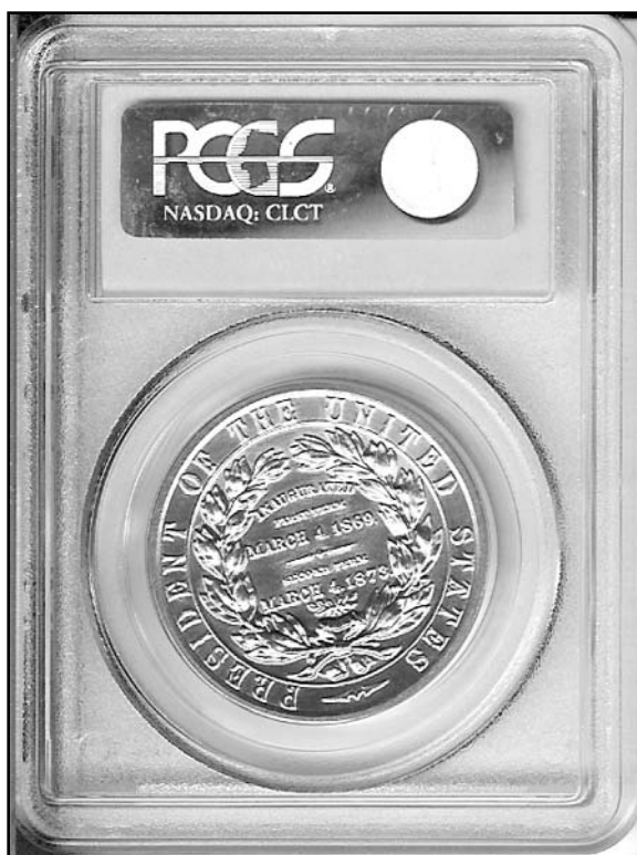
Figure 2a,b. Muled Presidential medal now certified by PCGS MS68.